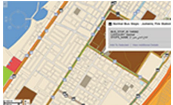
Advanced mapping capability and services offered by the portal